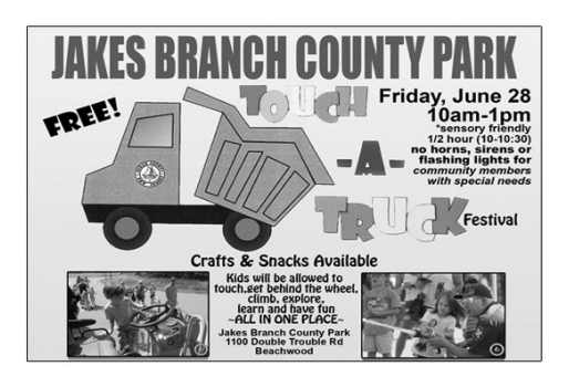
Touch a Truck 6/28